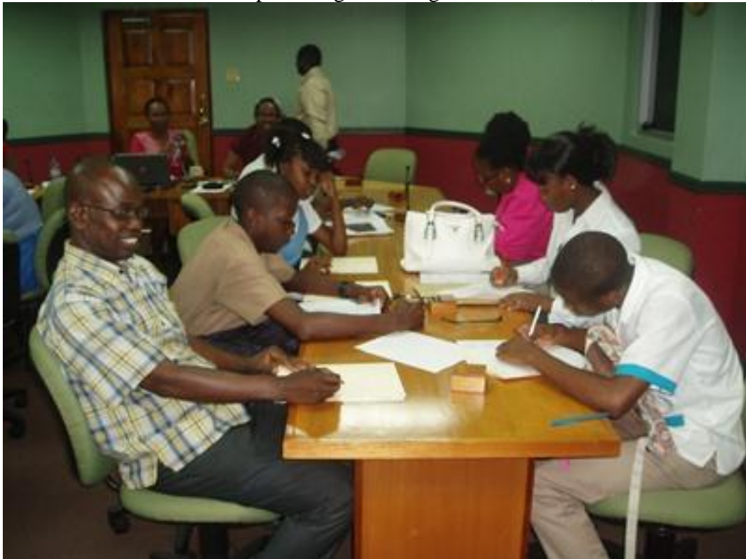
Pre-conference Workshop - Caribbean Child Research Conference University of the West Indies, Mona. June 13, 2012