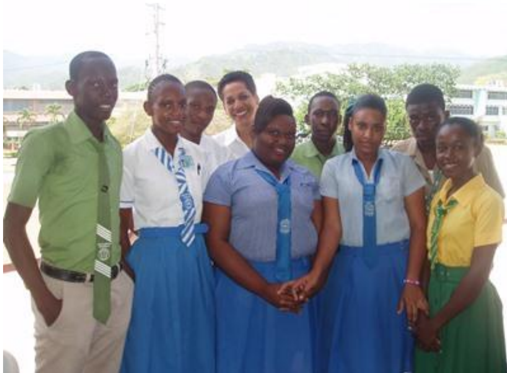
Pre-conference Workshop - Caribbean Child Research Conference University of the West Indies, Mona. June 13, 2012.