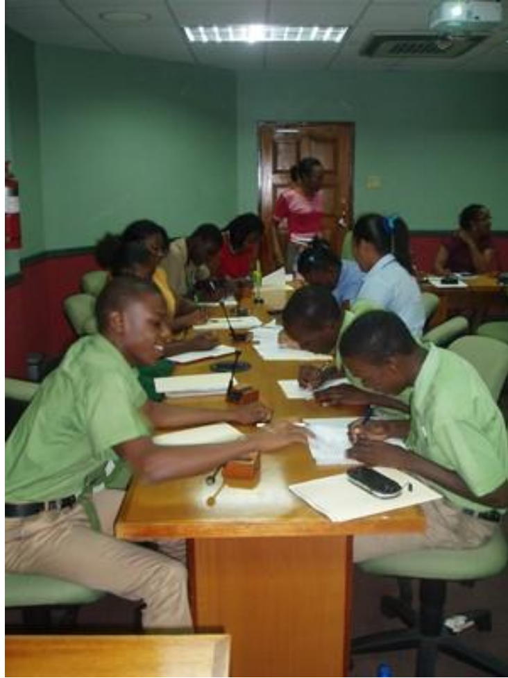
Pre-Conference Workshop - Caribbean Child Research Conference University of the West Indies, Mona. June 13, 2012.