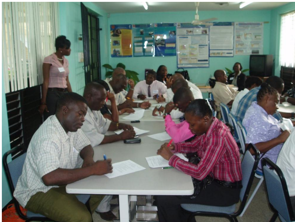
Correctional Officers participating in Child Rights & Responsibilities Workshop at CCDC