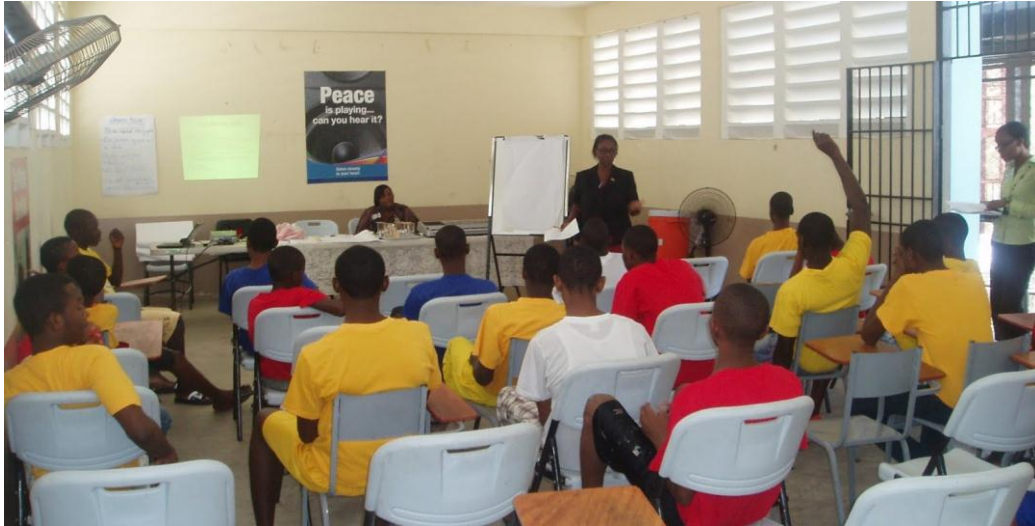
Child Rights training session with wards at Metcalfe Street Secure Juvenile Centre.