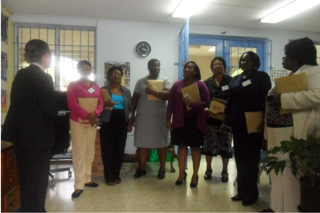
St. St.Kitts & Nevis Group meeting with Actg. Head of CCDC, June 18, 2012