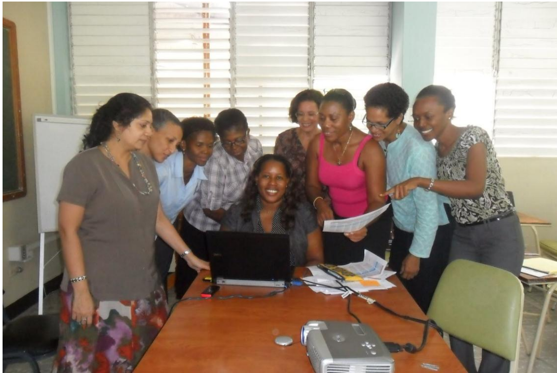
Staff Retreat - July 17, 2012