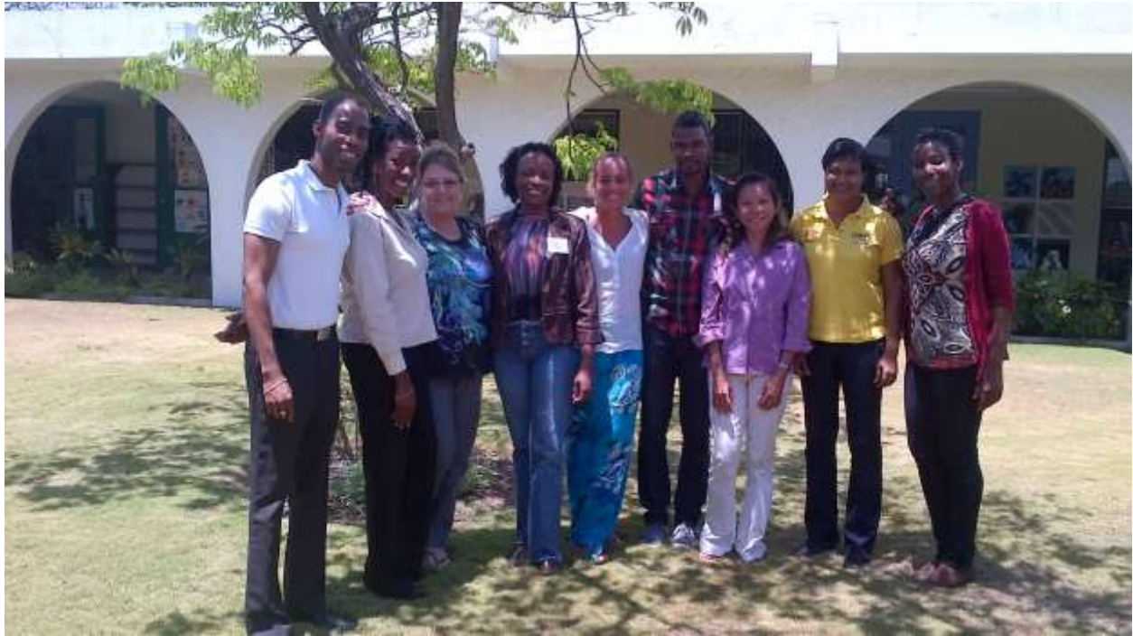
NGO Programme Evaluation Training Workshop pilot: participants and facilitators at CCDC