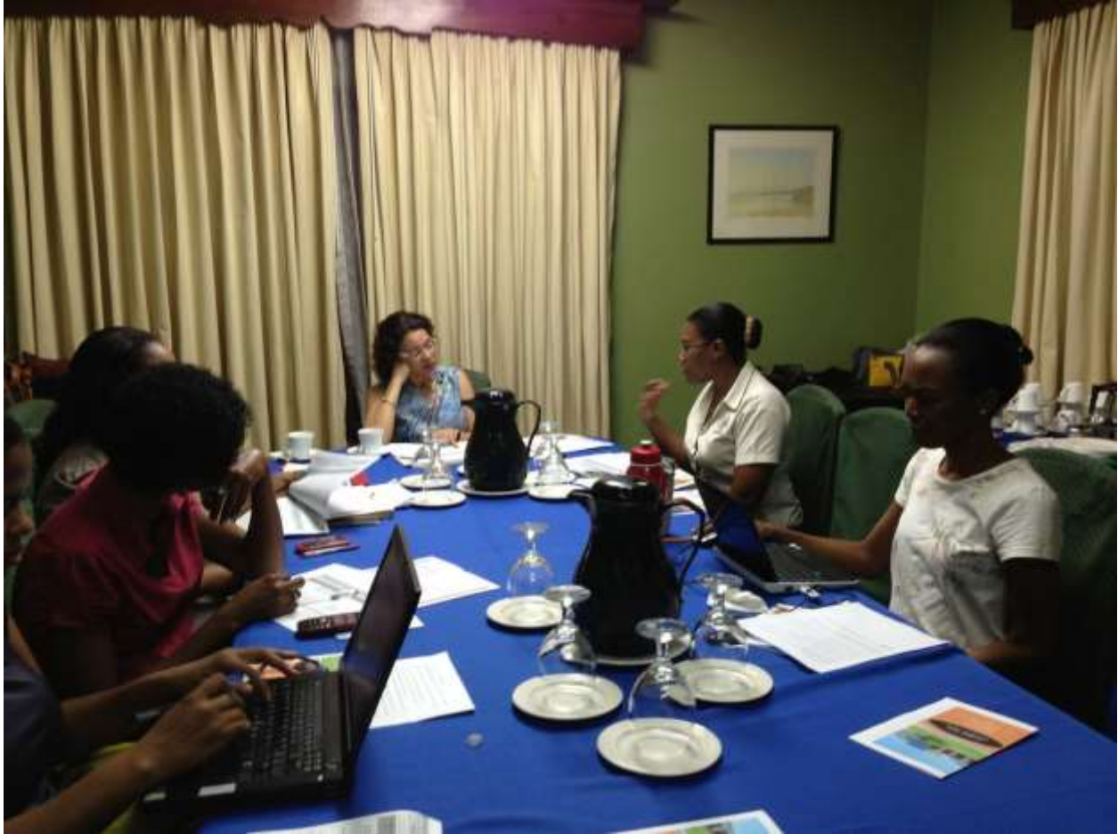
Staff attended Planning Retreat held at the Alhambra Inn Hotel on Friday, July 19, 2013