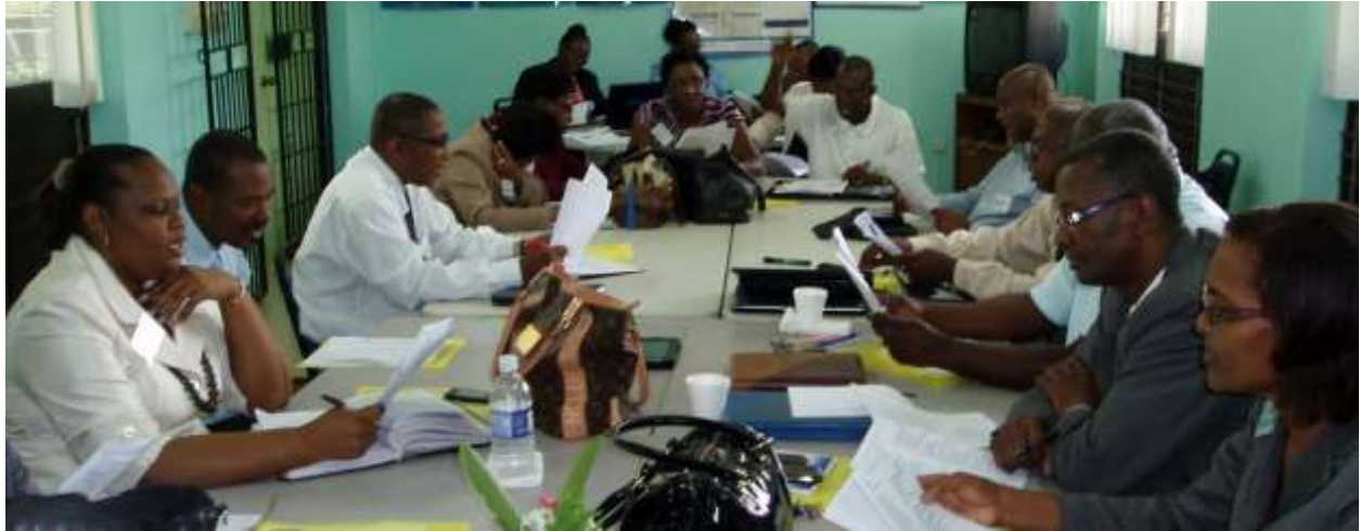
Senior Officers at Child Rights and Responsibilities Training Course