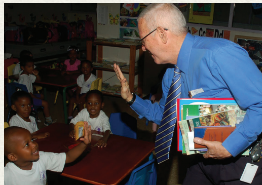
The Rev. Hon. Ronald Thwaites, Minister of Education, Jamaica greets children at the Kids on Campus (Caribbean Child Development Centre)