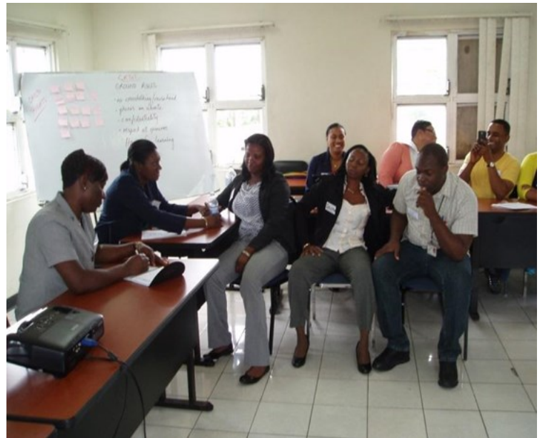
Photo: Area 1 Police Trainers engaged in role play at Freeport Station, Montego Bay, April 2015

The justification of the project remains intact and is strengthened by several anecdotal stories of positive results being seen, heard and felt. This is a timely and significant investment amidst the country's challenge to increase the promotion and protection of the rights of every child and represents the CCDC's efforts at inducing a systematic response to violence against children.