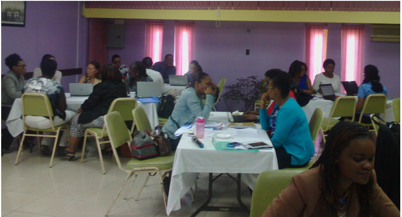
Photo: Project team at Project Retreat - Transitional Living Project for Children in State Care - February 19, 2016 at Social Welfare Training Centre

Amendments were made by USAID to the initial award for the project. The amendment includes the following: