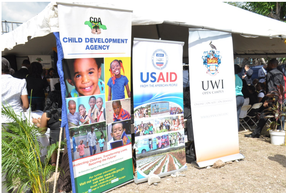
Photo: Transitional Living Project Ground-breaking ceremony

The United States Agency for International Development (USAID) have increased their support to the CCDC's Transitional Living Project for Children in State Care to the tune of USD$5,281,736. The main objective of the project is to support the creation of safe neighbourhood spaces and services for protecting and addressing the social needs and concerns of marginalized populations.