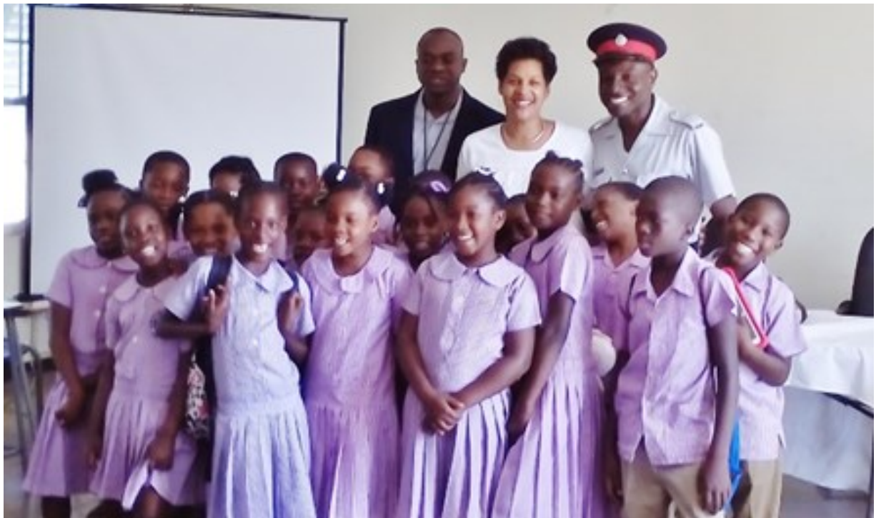
Photo: The Trainers received a surprise visit and song treat from a group of young students.