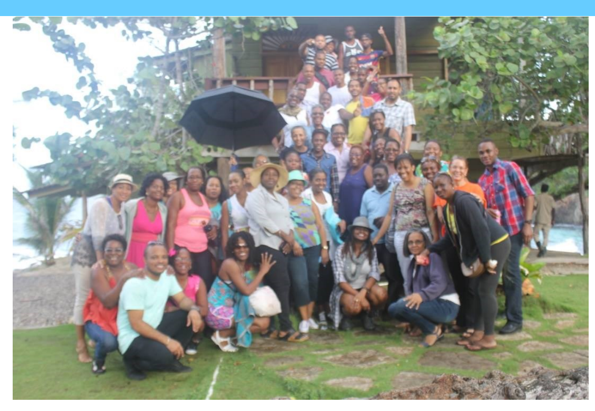
Photo: Staff of the UWI Open Campus Jamaica (including staff from the Caribbean Child Development Centre) attended the staff fun day at Strawberry Fields in St. Mary on December 18, 2015