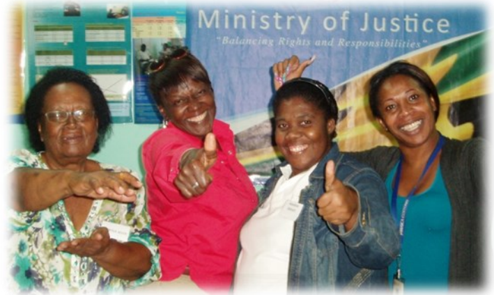
Photo: Participants from the Child Justice Unit, Ministry of Justice