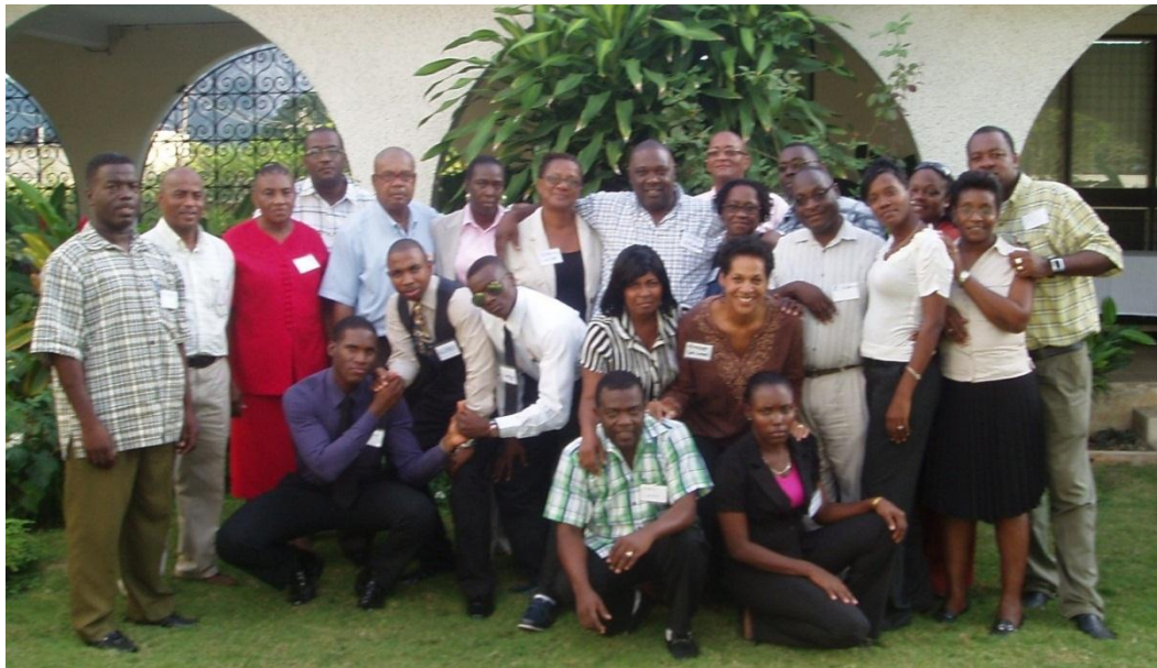
CRTSI first DCS staff group at CCDC, Dec 2011