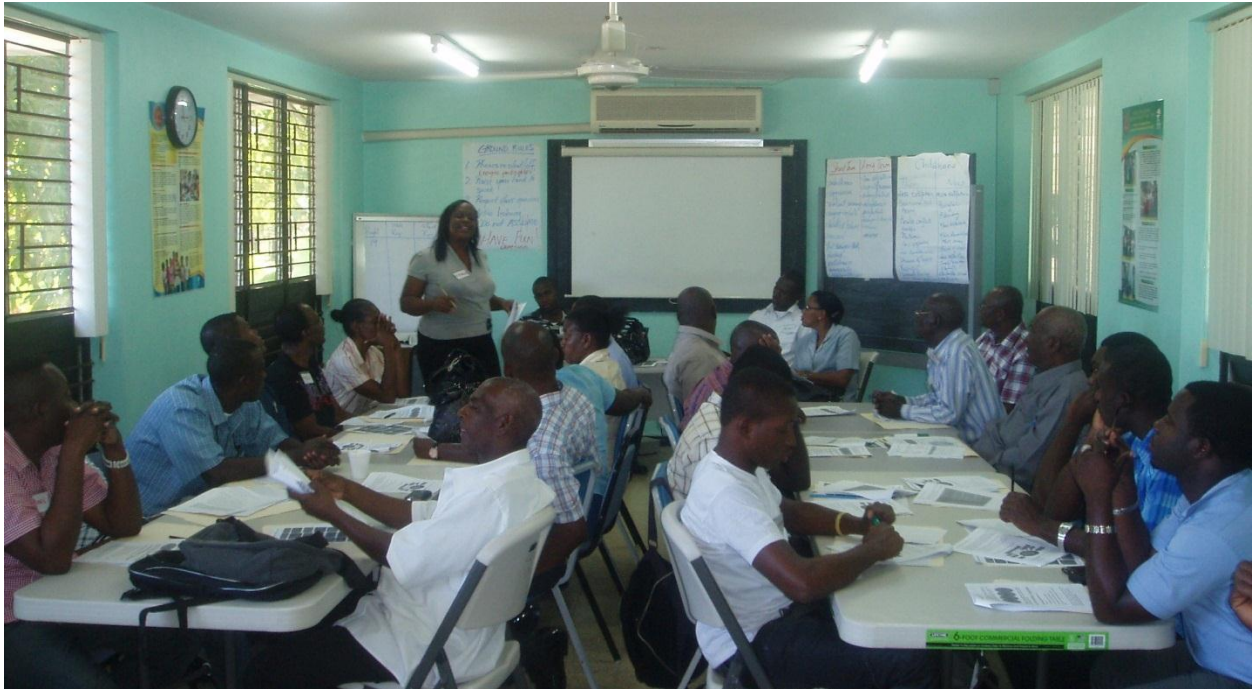
CRTSI DCS staff workshop at CCDC, March 2012