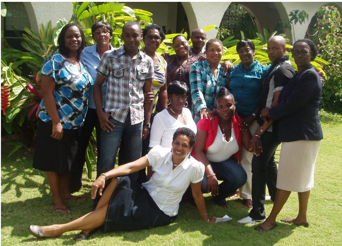
CRTSI DCS Trainers in training at CCDC, May 2012