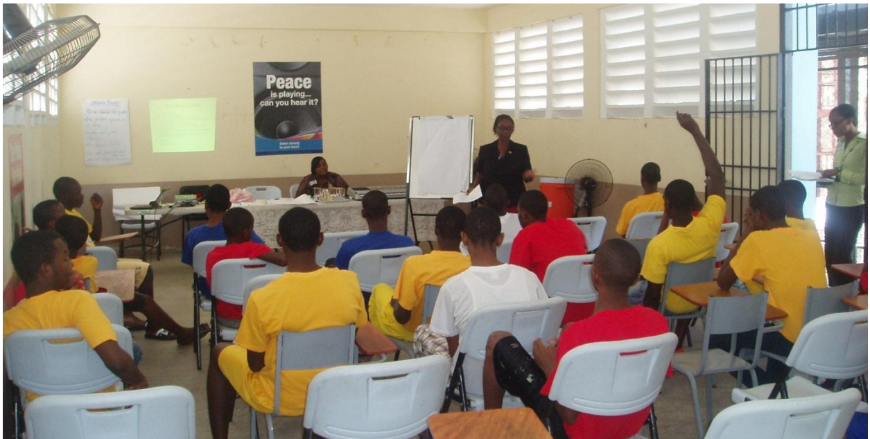
CRTSI session for boys at Metcalf Street Secure Juvenile Centre, March 2012