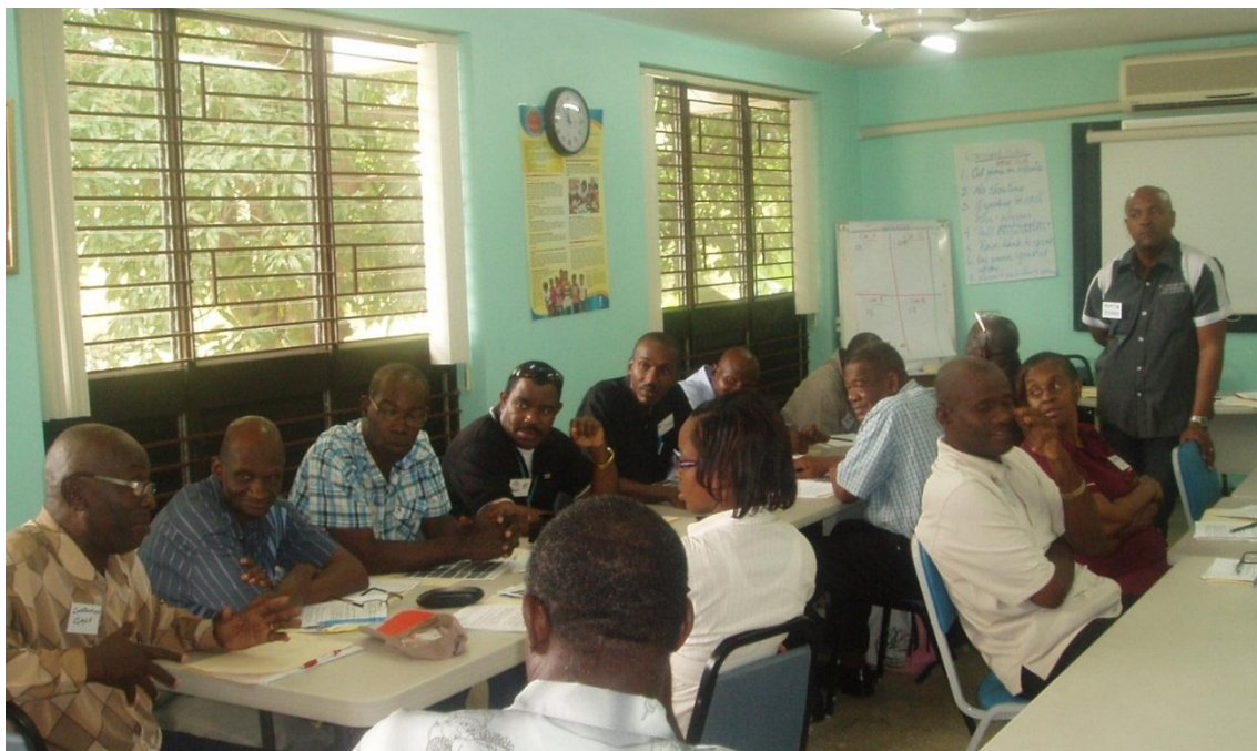
CRTSI DCS staff workshop at CCDC, March 2012