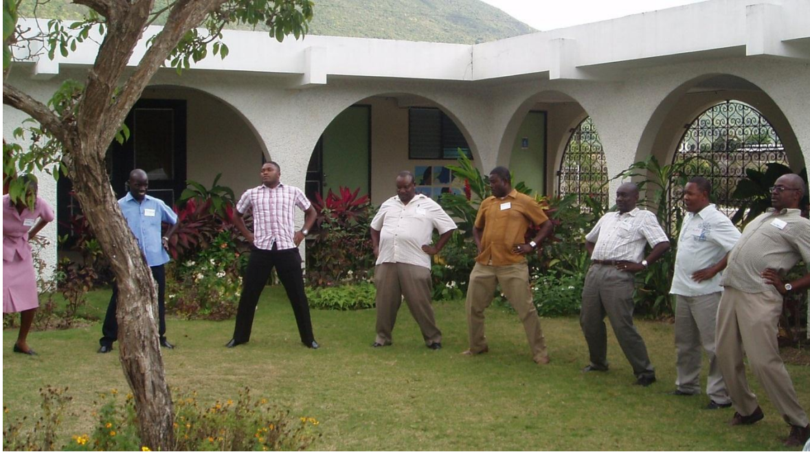
CRTSI DCS Staff Workshop participants being energised at CCDC, February 2012