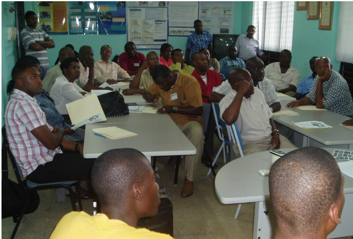
CRTSI DCS staff attentively listening to one of the boys from Metcalfe St. Secure Juvenile Centre, at CCDC, February 2012