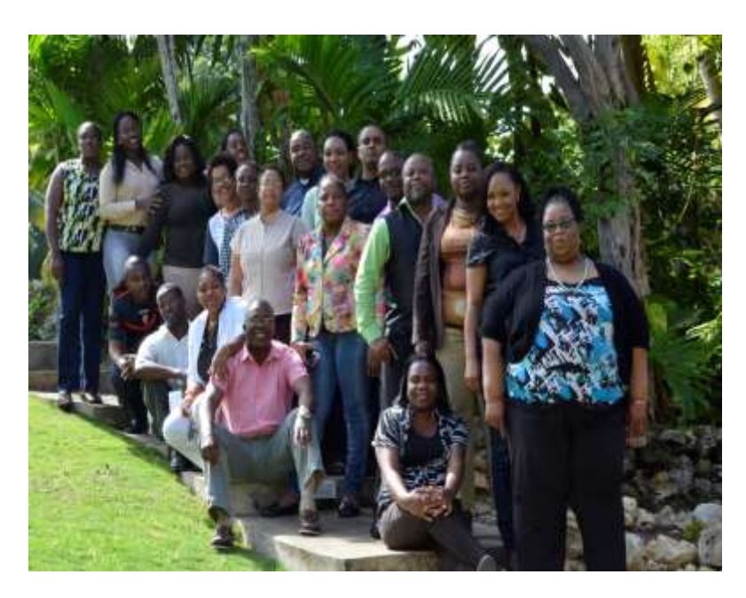
Photo: Child Rights & Responsibilities E-Learning Workshop for Police Trainers, held December 2–4, 2015 at Jewel Dunn's River Beach Resort & Spa, December 2015