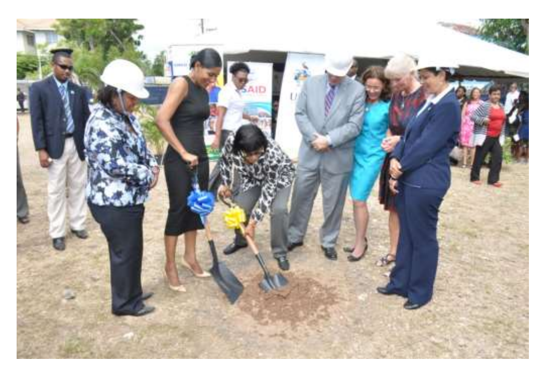
Photo: Groundbreaking ceremony for the Transitional Living Programme, Nov. 20, 2015 at Lady Musgrave Road