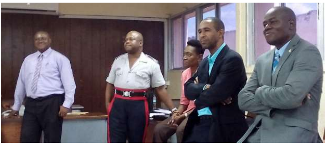
Photo: JCF Senior Officers' Training of Trainers, National Police College of Jamaica