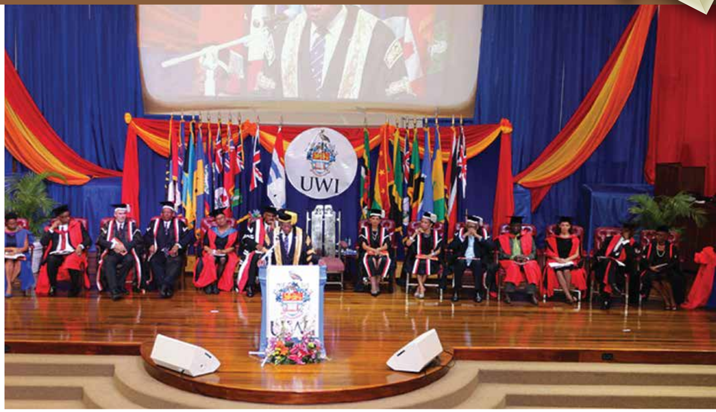
The Chancellor, Sir George Alleyne, addresses the gathering at The UWI Open Campus Graduation Ceremony in Antigua and Barbuda on October 10, 2015.