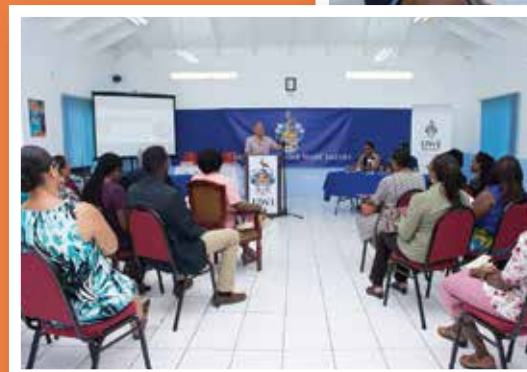
Librarians Attendees at the book presentation