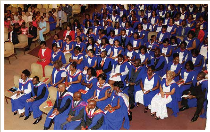
The UWI Open Campus 2015 Graduates