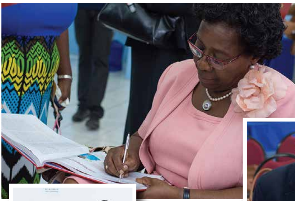
Her Excellency Dame Pearlette Louisy, Governor General of Saint Lucia signing books at the event