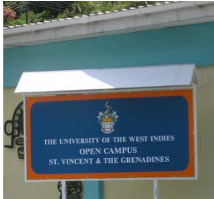
New sign at the St Vincent site

With limited resources the Campus was able to upgrade the computers in Anguilla, Antigua, Belize and Montserrat but this only brought these sites up to the minimum standards required.