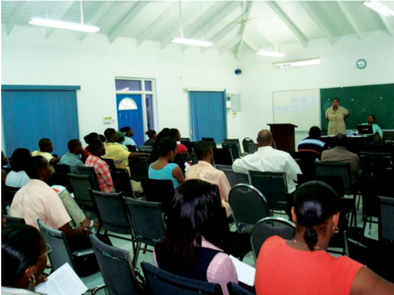
Students at orientation session at an Open Campus site