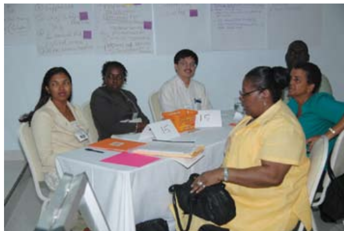
Staff Group at Open Campus Retreat in Jamaica, July 2008