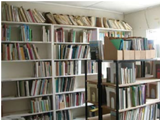
The Women and Development (WAND) Library, Open Campus Consortium for Social Development and Research.

While recognising the central place of library and information services within the mandate of the Open Campus, the Campus had to survive its first year without a substantive Campus Librarian in place, and thus without overall co-ordination of the various libraries within OCCS and the CSDR. In preparation for a more active role of the Libraries throughout the sites, four Librarians from within the former SCS attended the 13 th Off-Campus Library Services Conference in Utah in April 2008.