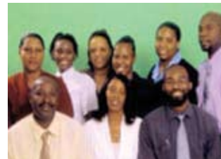
Open Campus Alumni Group