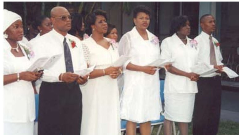
Students of the Social Welfare Training Centre at Certification Ceremony