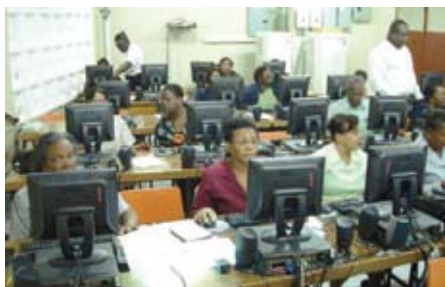
Students in a class session at an Open Campus Site

During the year, existing programmes were offered across the region. The Open Campus Country Sites in each country continued to serve the needs of adult learners through the offering of several certificate and diploma programmes as well as short courses, seminars and workshops, some of which were tailored for specific local needs such as a week-long workshop developed and implemented by the St Lucia site for the Ministry of Planning in Report Writing and Customer Service for 30 and 17 participants respectively. Total enrolment in all courses offered by the sites regionally was 17,819 students, with Trinidad and Tobago leading the way in student enrolments.