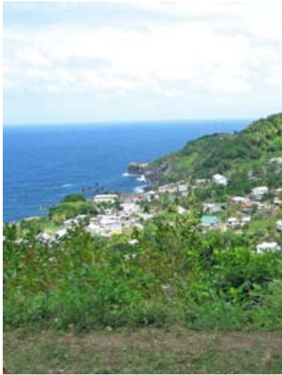
View of Fancy Community with which WAND is conducting research