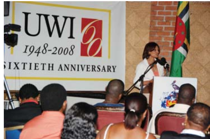
UWI Dominica Alumni Meeting

Alumni are actively involved in other aspects of the running of the Centres, including sitting on the Advisory Committees as well as participating in activities such as awards ceremonies at each site. The UWI Centre in each country serves as the anchor and home for the alumni chapter and provides administrative and clerical support to the chapters.