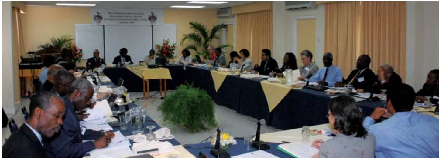
The inaugural meeting of the Campus Council