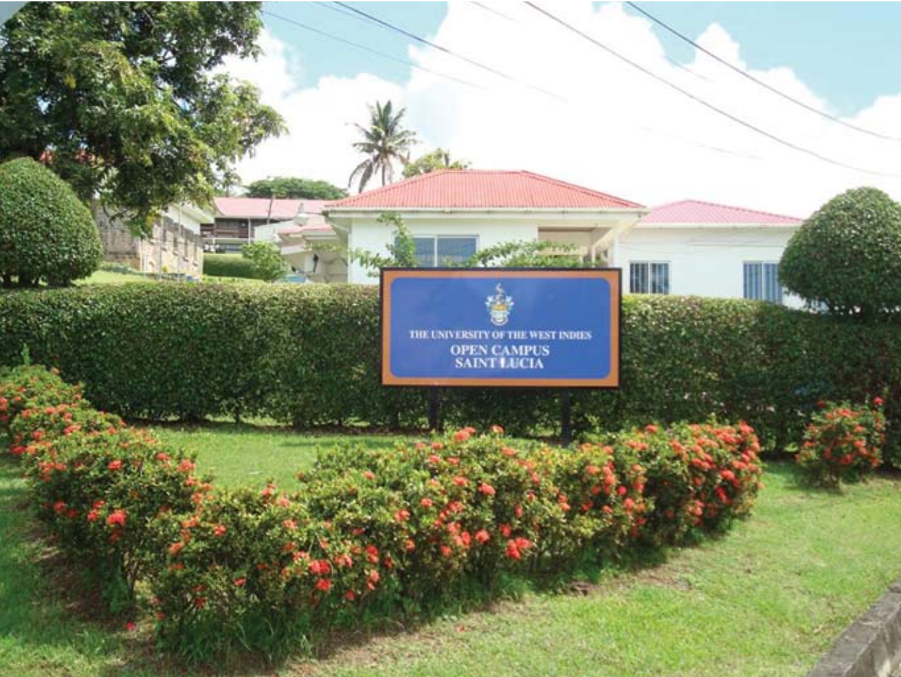
Open Campus Site in St. Lucia