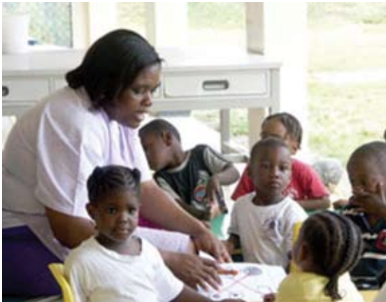
Caribbean Child Development Centre; Children at the CCDC Centre