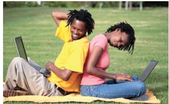
Open Campus students able to access Open Campus programmes Anywhere, Anytime

The Office of ERIIC stood ready to assist with existing franchise programmes. In the year under review 564 students were enrolled in various franchised degree programmes and another 250 in Social Science Certificates, as shown in Tables 5 and 6.