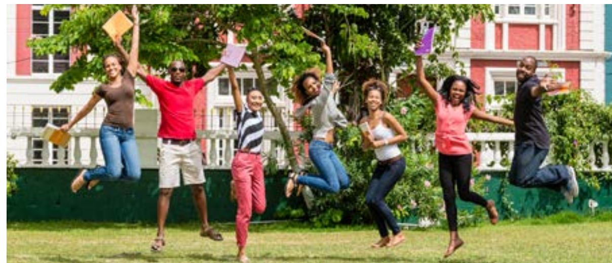
@ The UWI Open Campus