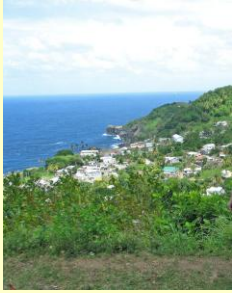
Fancy, St. Vincent & the Grenadines