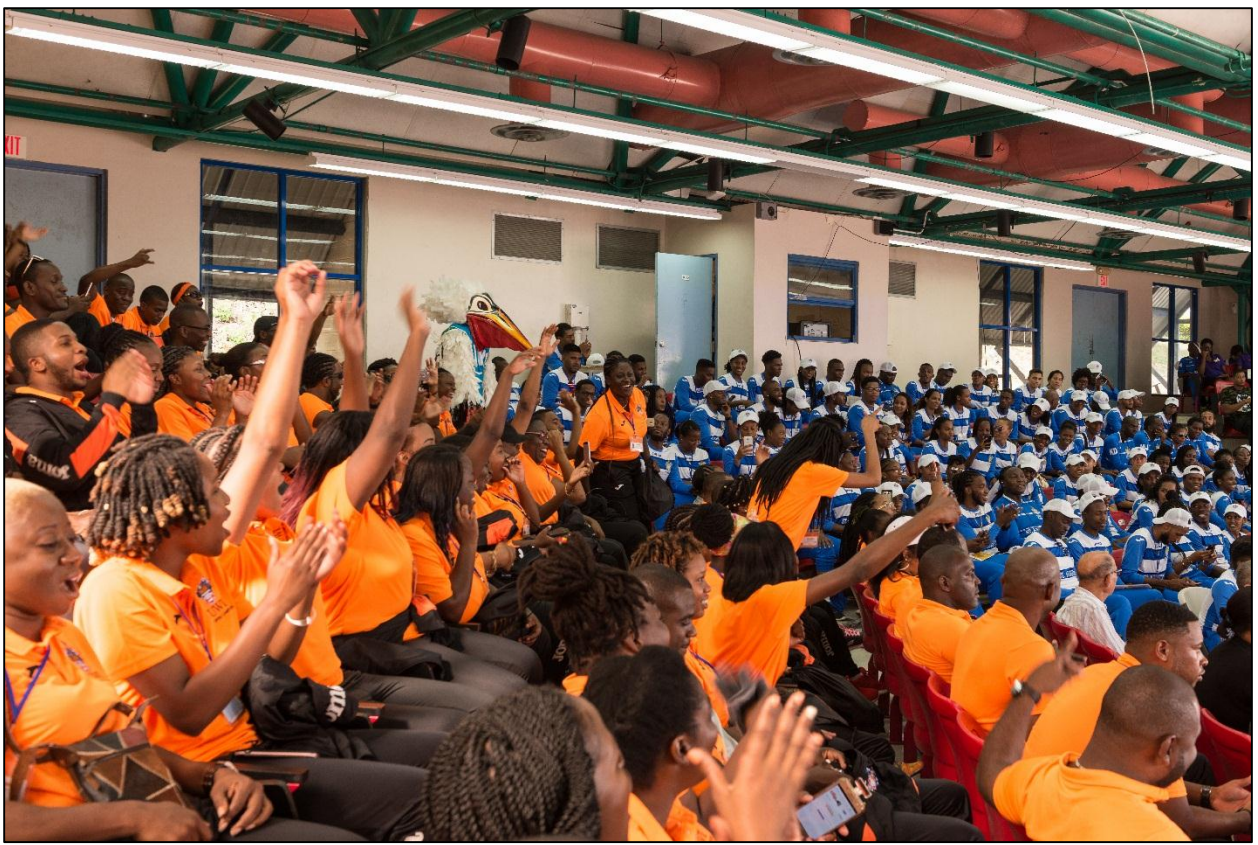
The atmosphere was anticipative, the Open Campus was bold and the ceremony was a blast!