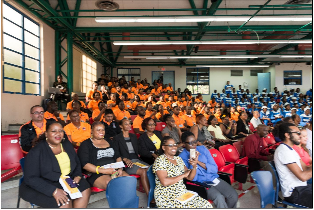
Then came the meet and greet to kick off the socialization component of The UWI Games: